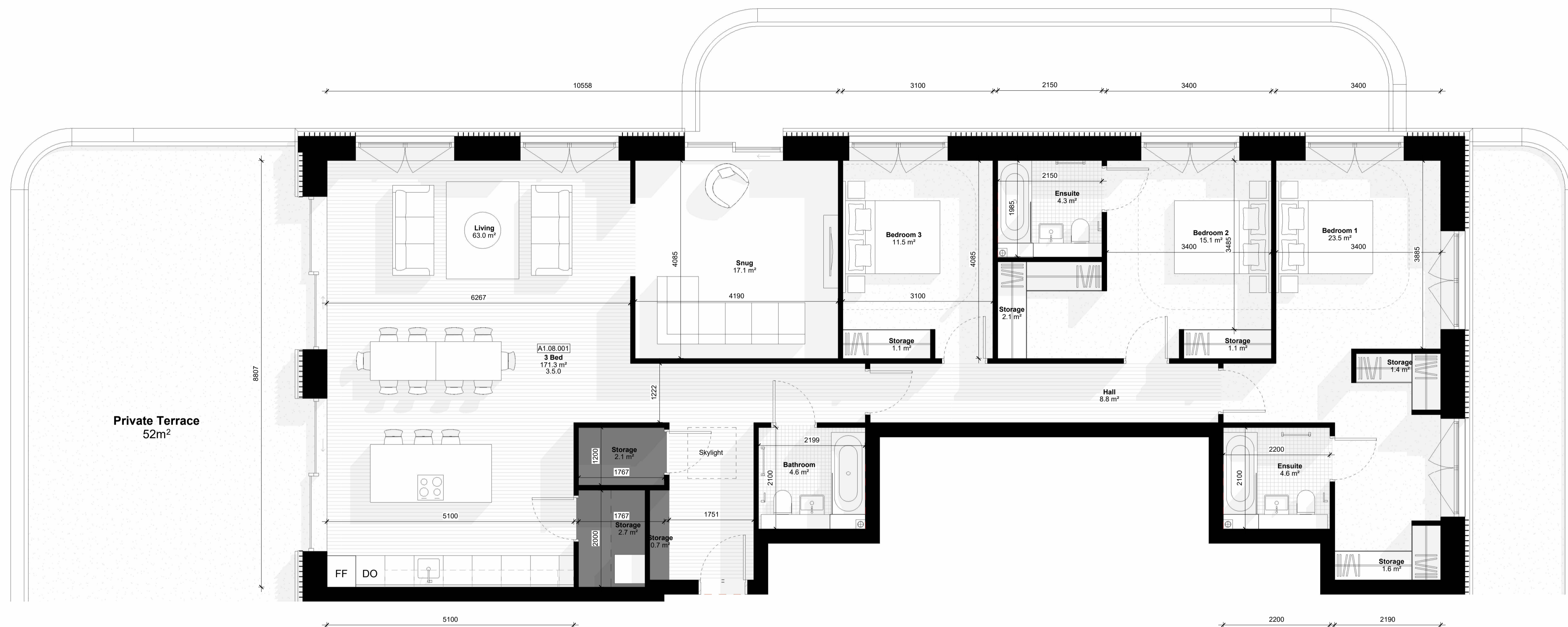
(70) PLN_BA_APT 3.5.0 1 : 50