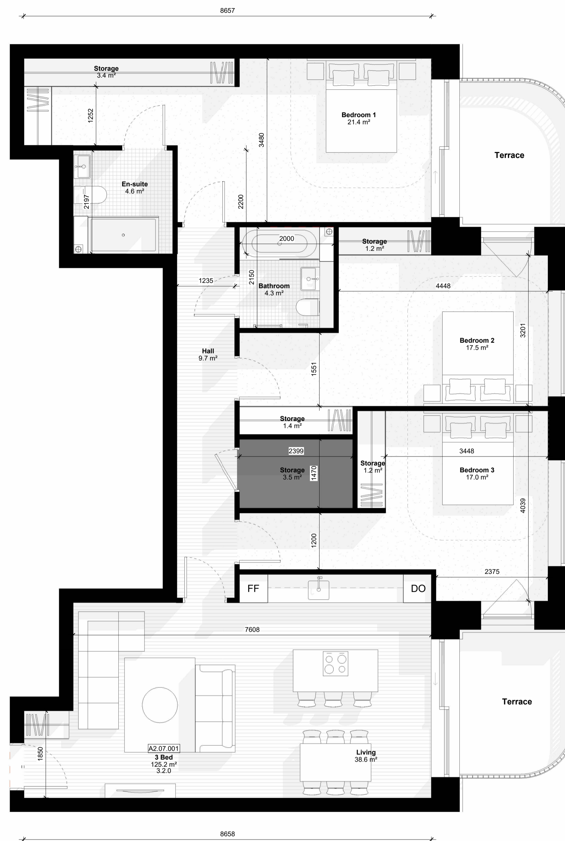
(70) PLN_BA_APT 3.2.0 1 : 50