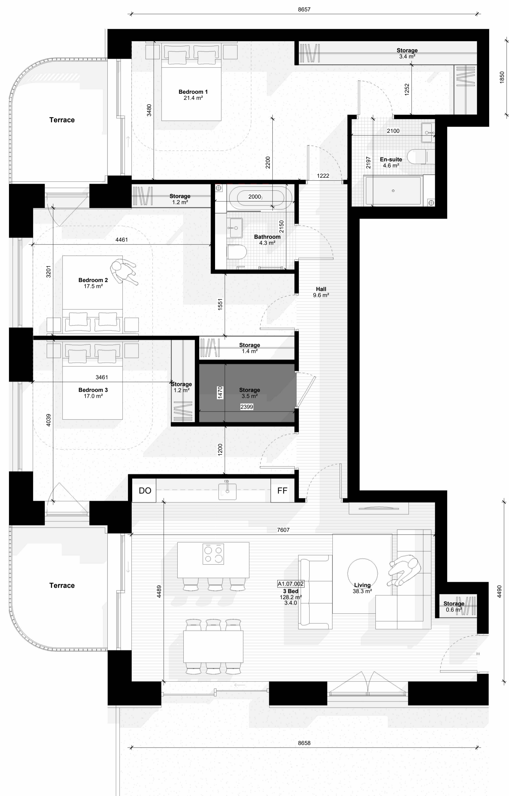
(70) PLN_BA_APT 3.4.0 1 : 50