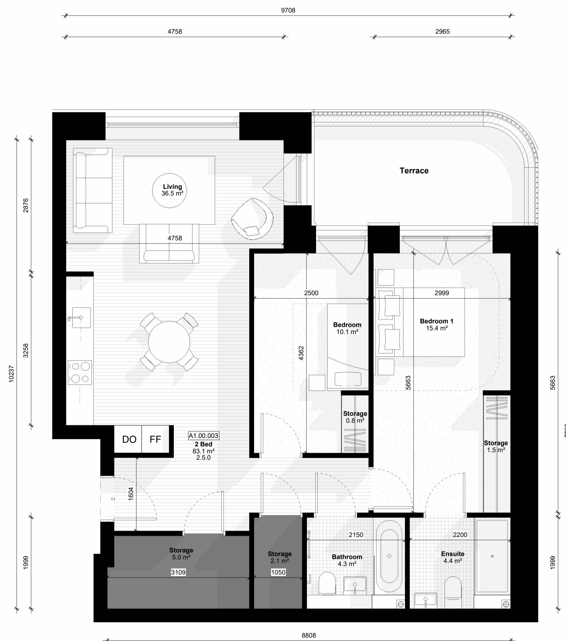
(70) PLN_BA_APT 2.1.2 1:50