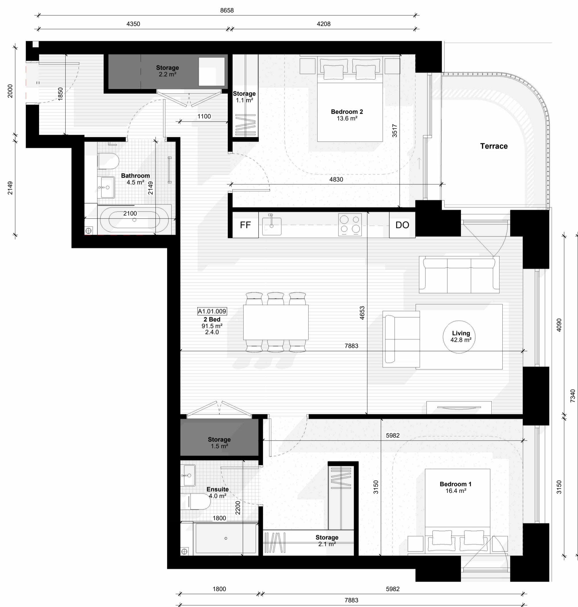
(70) PLN_BA_APT 2.4.0 1:50