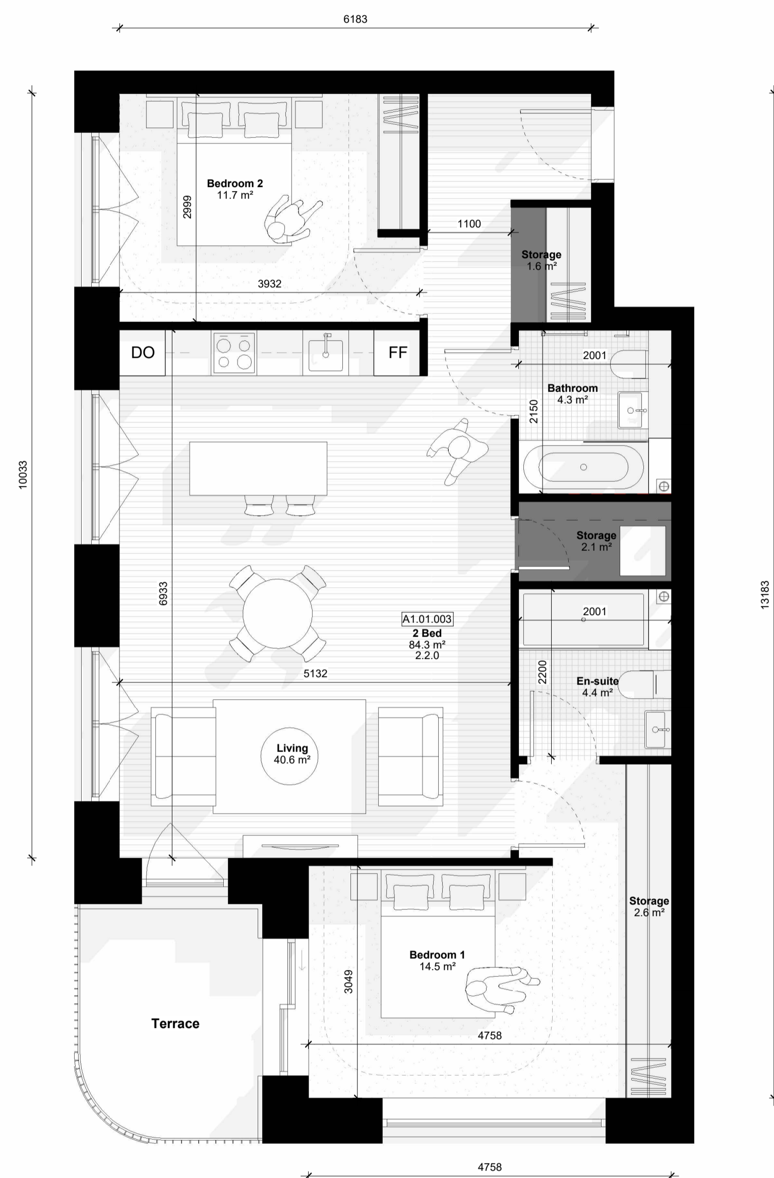
(70) PLN_BA_APT 2.2.0 1:50