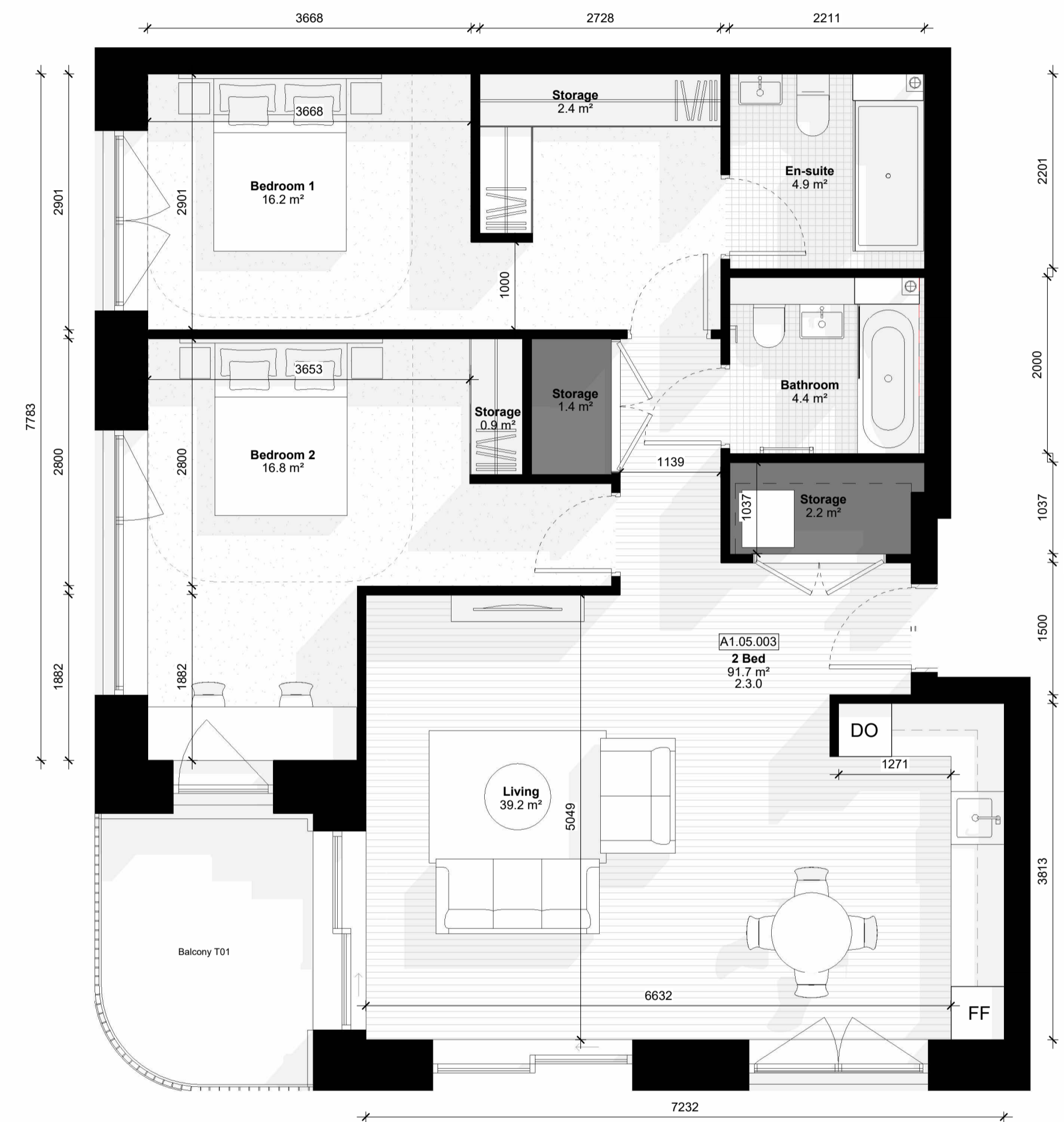
(70) PLN_BA_APT 2.3.0 1:50