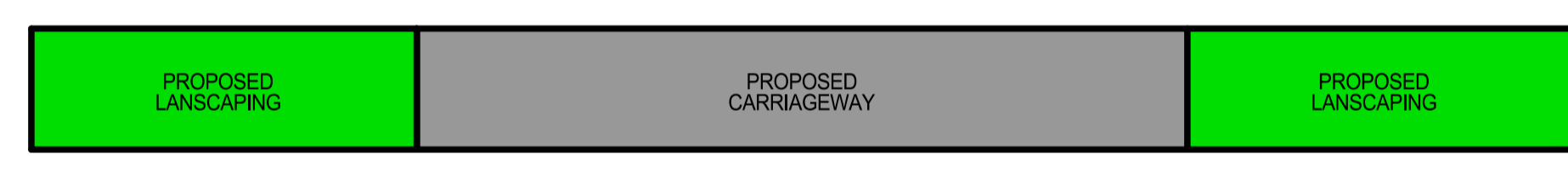
CROSS SECTION A-A